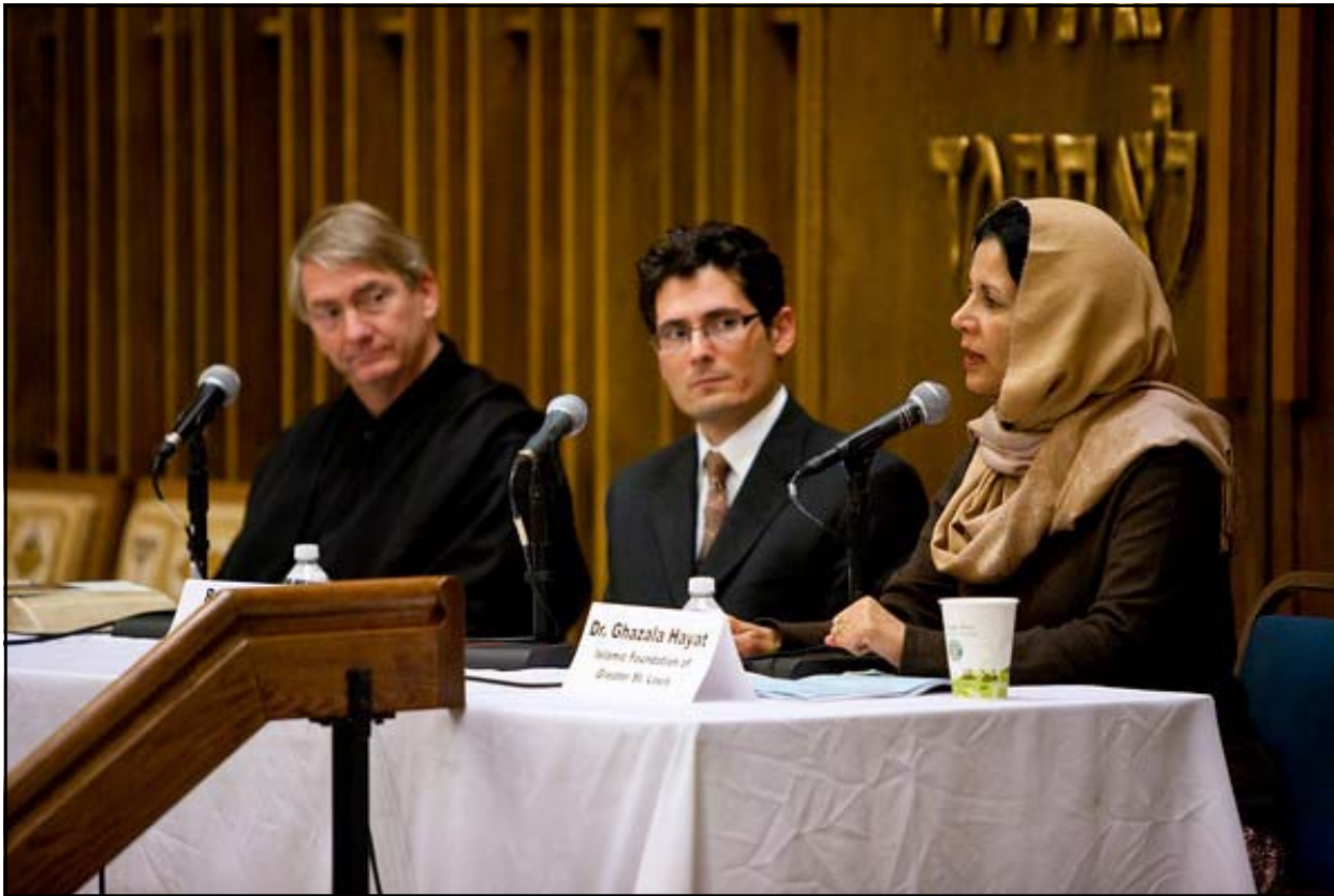
Panelists at Temple Emanuel's Nov. 18 discussion of the Besa obligation.