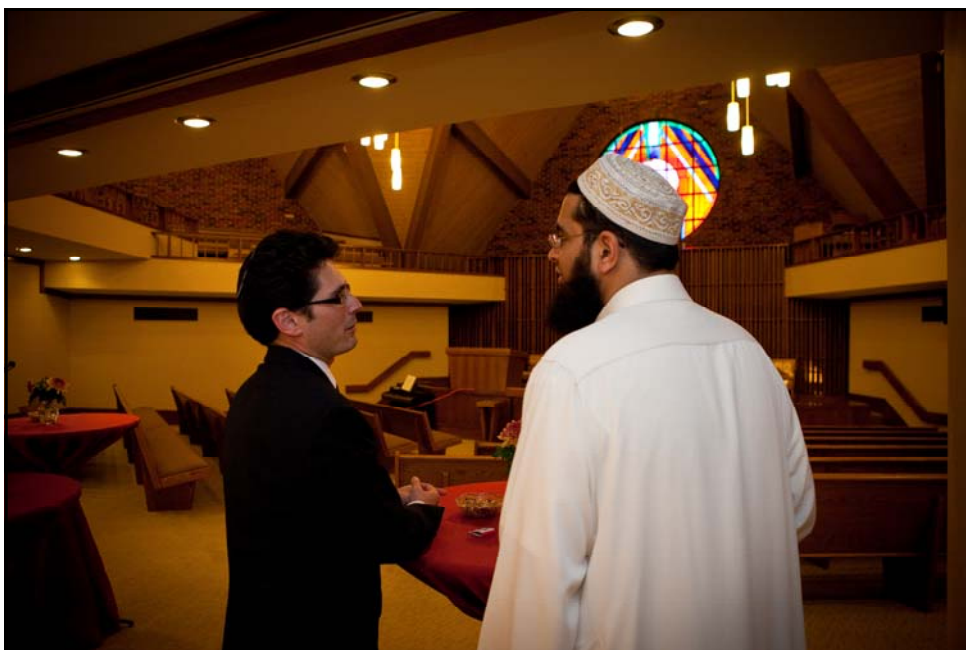
Above: A visitor looks over the BESA exhibit on display at Temple Emanuel.